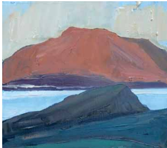
Scott Redden, "Orange Glory", 2010, Oil on Board, 8"x9"