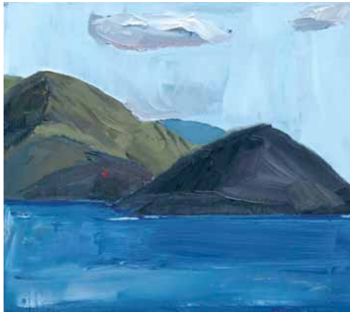
Scott Redden, "Clouds Go By", 2010, Oil on Board, 8"x9"