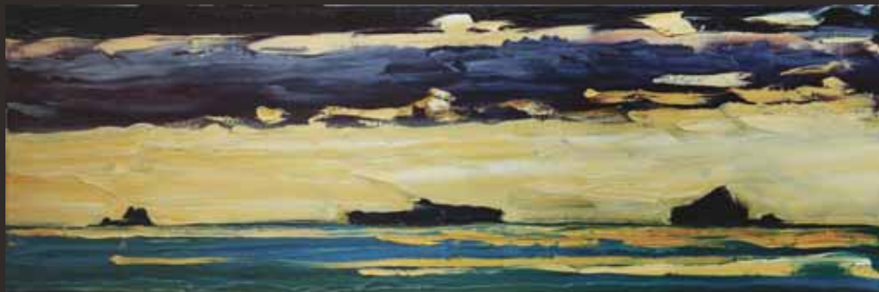
Rod Coyne, "Atlantic Islands", Oil on Canvas, 40 x 120cm