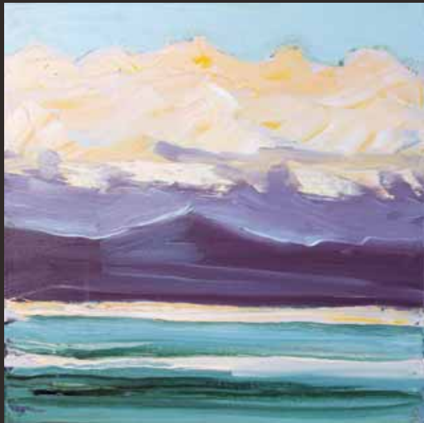
Rod Coyne, "Coomacarrea Pink", Oil on Canvas, 40 x 40cm