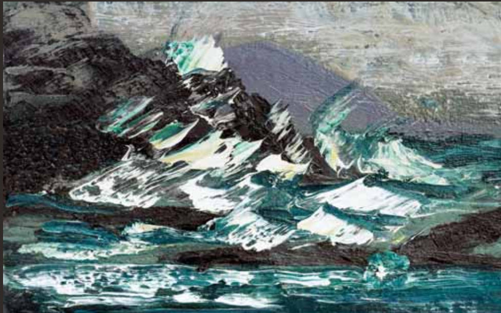
Rod Coyne, "Horse Whipped", Oil on Canvas, 23 x 30cm