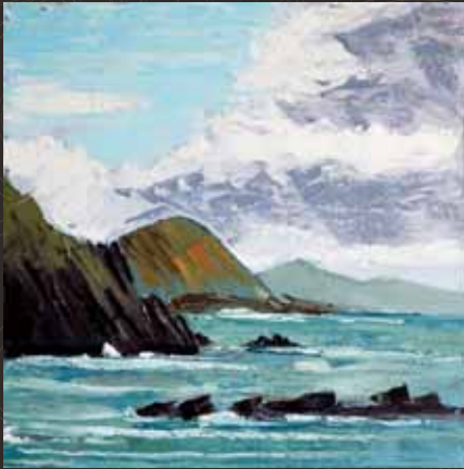
Rod Coyne, "Blue Weather", Oil on Canvas, 60x60cm