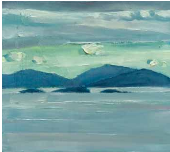
Scott Redden, "Clouds and Mountains", 2010, Oil on Board, 8"x9"