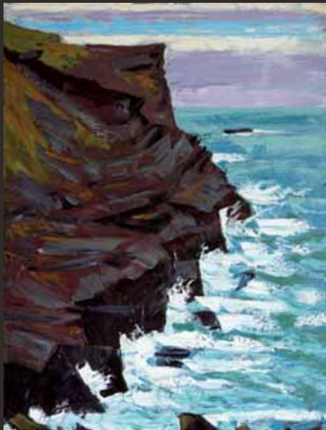
Rod Coyne, "Cliff Hanger", Oil on Canvas, 70 x 100cm