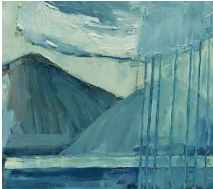
Scott Redden, "Rain Comes", 2010, Oil on Board, 8"x9"