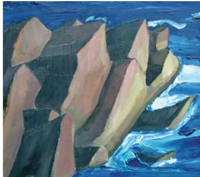
Scott Redden, "The Steps", 2010, Oil on Board, 8"x9"