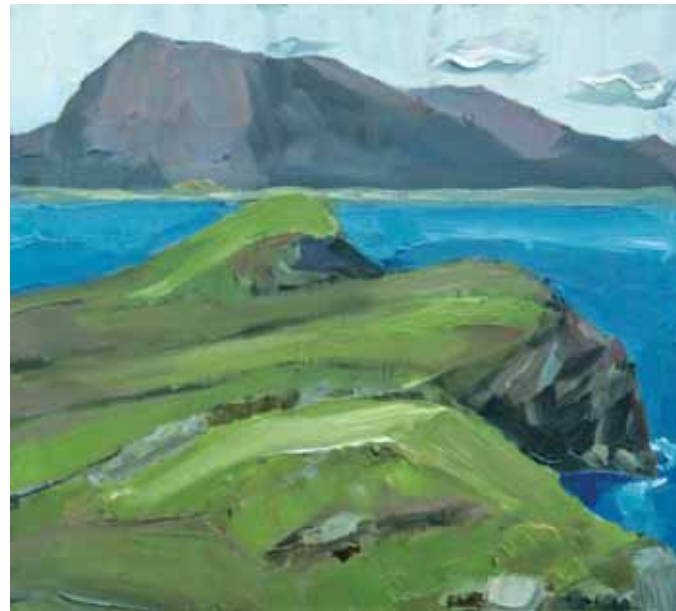
Scott Redden, "Ballinskelligs Point", 2010, Oil on Board, 8"x9"