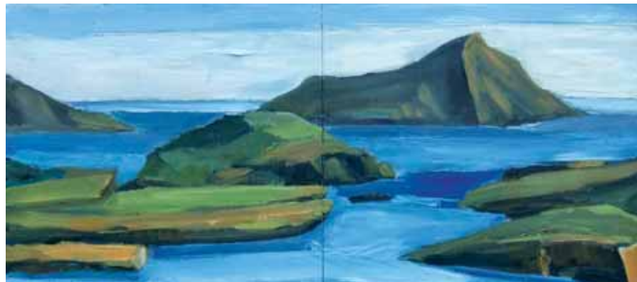
Scott Redden, "Islands off Valentia", 2010, Oil on Board, 2x 8"x18"