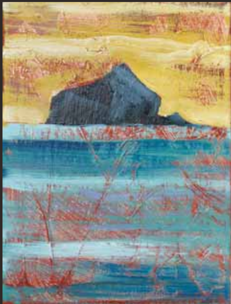
Rod Coyne, "Bull by the Horns", Oil and Copper Leaf on Canvas, 18 x 24cm